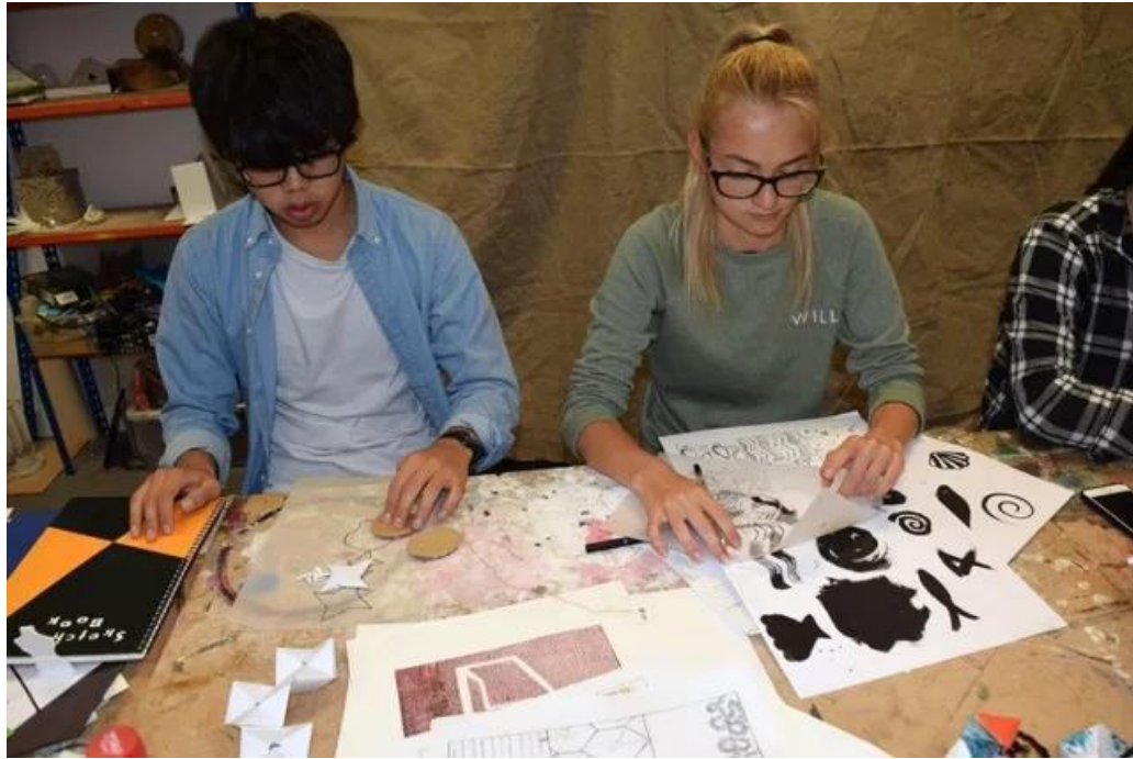
国际创意艺术学校 ISCA 伦敦艺术大学附属高中